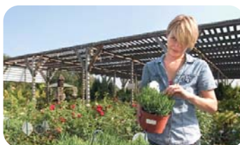
Small Business Sector