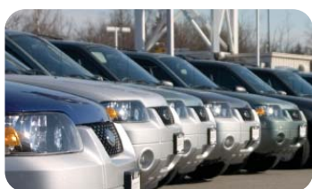
Fleet and Commercial Motor